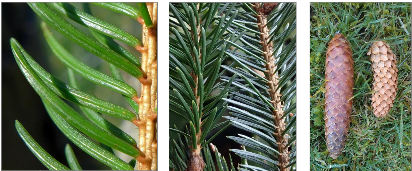
Figure 2: Left to right - evenly coloured Norway spruce needles, distinctly different coloured upper and lower surfaces of Sitka spruce needles, and Norway (left) and Sitka (right) cones.

Like other members of the pine family the foliage is needle-like, but in spruce the single needles are attached to the shoots via a short woody 'peg' (fig. 2). The individual needles can be the same colour all over like Norway spruce and White spruce, or have distinctly differently coloured surfaces like Sitka and Serbian. (fig. 2). Needle tips can be sharply pointed, as in Colorado and Sitka, or less so as in Norway or Serbian. Like other Pinaceae the male and female cones are separate but occur on the same tree. In all spruce species the female spruce cones are initially upright but after pollination they turn and hang down below the shoots. In common with all other Pinaceae each cone scale houses a pair of winged seeds.