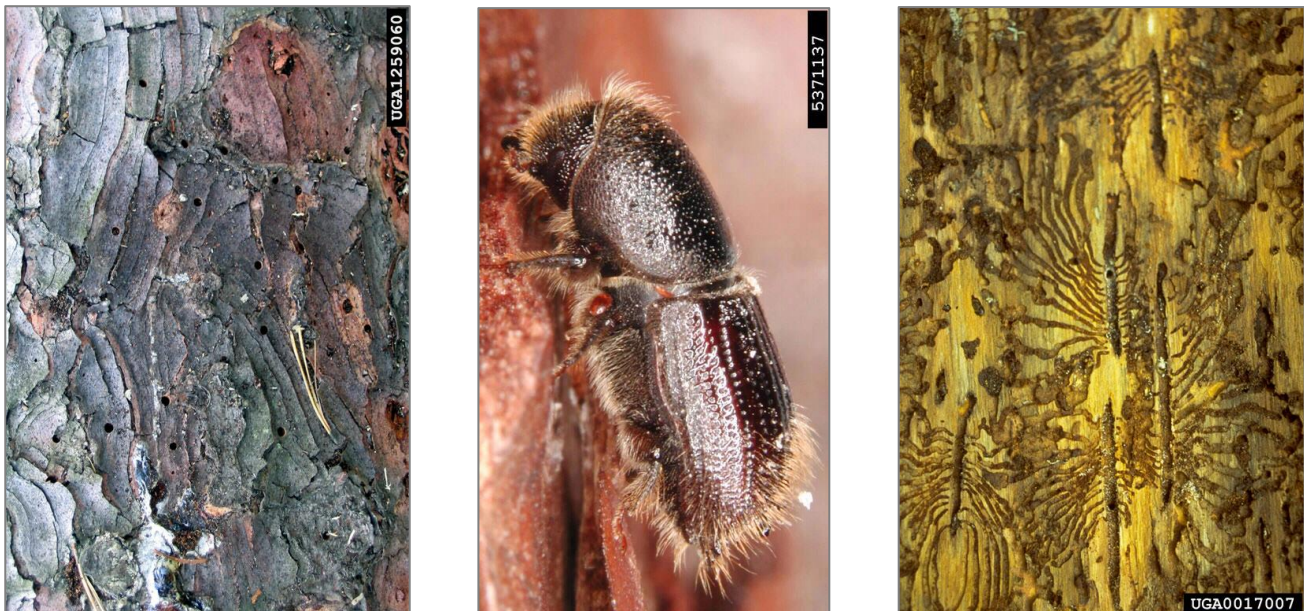
Figure 6: left to right – Larger eight-toothed bark beetle holes, adult larger eight-toothed bark beetle, and right, larger eight-toothed bark beetle feeding galleries

Larger eight-toothed spruce bark beetle ( Ips typographus ), a regulated quarantine pest here in GB, is present in spruce across mainland Europe and was found breeding in Kent in 2018. Since then, several further small outbreaks have been found in the southeast of England and are subject to eradication measures. On the continent, numbers reach colossal levels, and the beetles are then able to overwhelm the defences of healthy trees. In the southeast of England, pioneer populations of the pest are much smaller, and the pest targets dead and dying spruce material to breed on. Pay particular attention to such stressed material – recent windblow, snapped tops and harvesting residue, and if you manage land, ensure that material like this is cleared up as quickly as possible to prevent Ips typographus from establishing. The holes made by adult beetles (fig. 6) are small (2-2.5mm in diameter) and are not accompanied by the resin tubes and associated resin streaking seen in the larger D. micans . Galleries below the bark have a distinctive appearance with multiple galleries radiating out from a single central one (fig. 6). Ips typographus requires identification by experts in a laboratory, so if you find anything suspicious, please report it using TreeAlert . For more information about this important pest visit the Forest Research Ips typographus webpage .