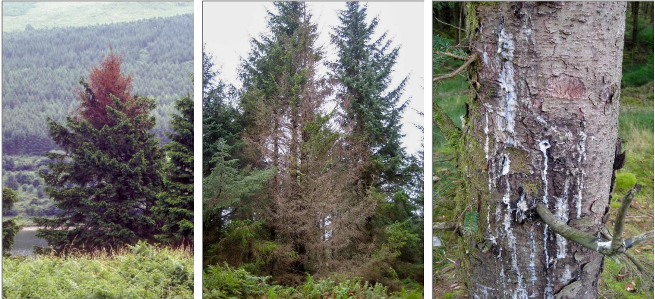
Figure 4: left to right - crown dieback associated with early infestation of GSBB, extensive branch needle loss and branch death, profuse resin bleeds from entry holes made by female GSBB