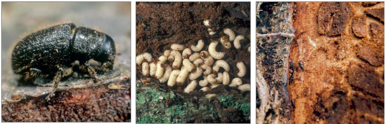
Figure 3: left to right - adult female GSBB, larvae, and the 'quilted' appearance of galleries

maintaining a clear feeding front by piling frass and dead/diseased larvae behind them and creating a brood chamber. The accumulated frass forms 'islands' within the chamber resulting in a distinctive quilt-like appearance (fig. 4). Once mature the larvae retreat to these frass islands to pupate, often en masse . Once the adults hatch they frequently mate with their siblings before exiting the tree via circular holes in the bark. In the UK the complete lifecycle can take 18-25 months which leads to extensive overlap of generations and consequently any life-cycle stage can be found at any time of year.