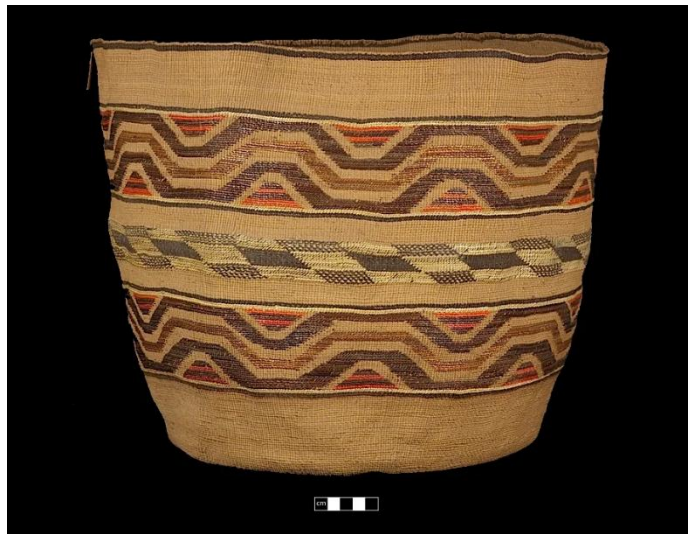
Figure 1: Storage basket woven from Sitka spruce roots by the Tlingit of southeast Alaska

We’re probably most familiar with spruce in the form of Christmas trees and forestry plantations, though today Norway spruce ( Picea abies ) is being rapidly replaced by ‘non-drop’ firs ( Abies species). Norway spruce has been grown here since at least 1500 while Sitka ( P. sitchensis ) was introduced to the UK from the Pacific north-west of the USA in 1831. Sitka is now the dominant species in production forestry in the UK and forms the bulk of conifer forestry plantations in the west and north of the British Isles; 63% in Wales, 61% in Scotland and 28% in England (National Forest Inventory, 2024). Sitka wood has a high strength to weight ratio and has a wide range of uses including structural timber, pallets, fencing, panel products and paper.