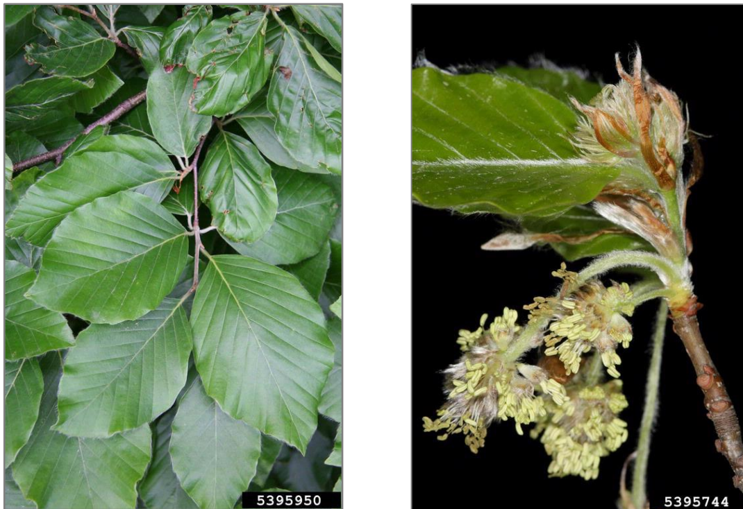
Figure 2: Common beech leaves (left). and flowers (right) - catkin-like male flowers bottom left of the picture with female flowers at the shoot tip above. Note the fringe of fine hairs along the leaf margin.