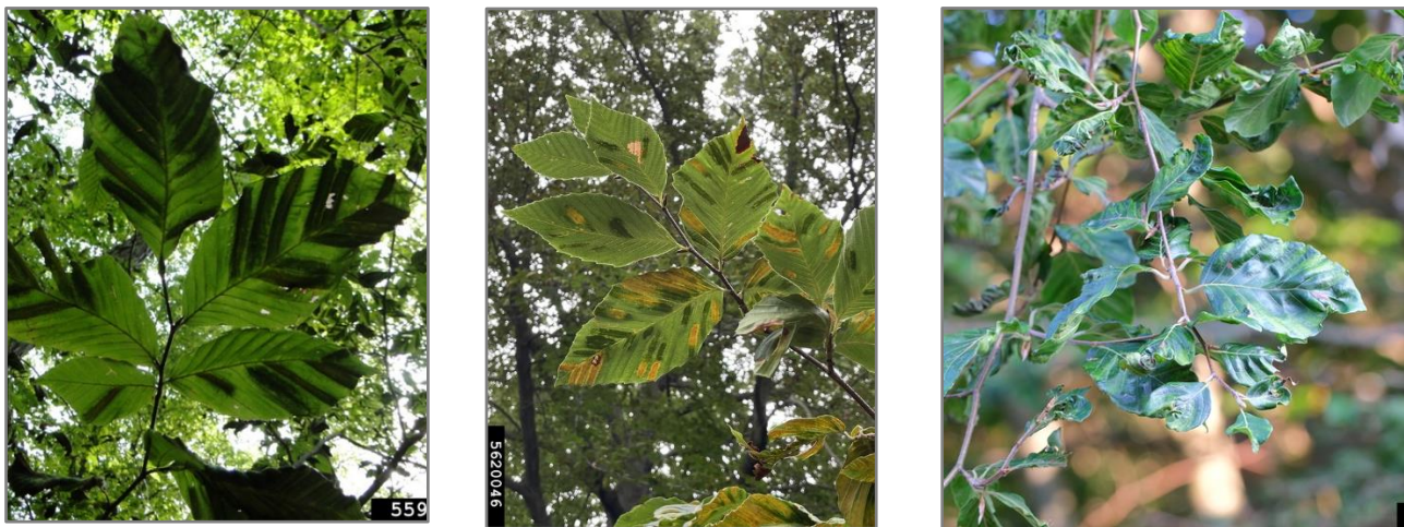
Figure 3: Dark bands between lateral veins of beech leaves (left, Yonghao Li, The Connecticut Agricultural Experiment Station, Bugwood.org), bands turning yellow as symptoms progress (middle) and reduced leaf size of affected trees (right), Matthew Boden, Bartlett Tree Experts, Bugwood.org)

The first sign of BLD and a key diagnostic feature is the appearance of dark bands between the lateral veins on the leaves in early summer, best observed from below. Note that the individual dark bands do not cross the lateral veins. The banded areas gradually take on a leathery texture, frequently accompanied by chlorosis giving a yellow appearance. Over the ensuing few years the canopy begins to thin due to buds being aborted, a reduction in leaf size and premature leaf drop (fig. 3). Saplings displaying symptoms are usually killed within five years, and large trees within ten.