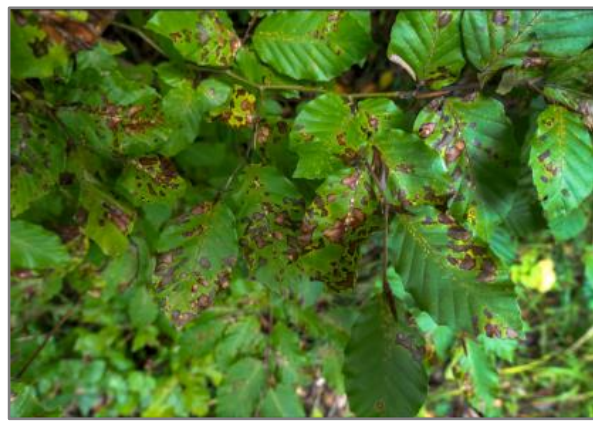
Figure 5: Typical symptoms caused by Petrakia liobae on common beech