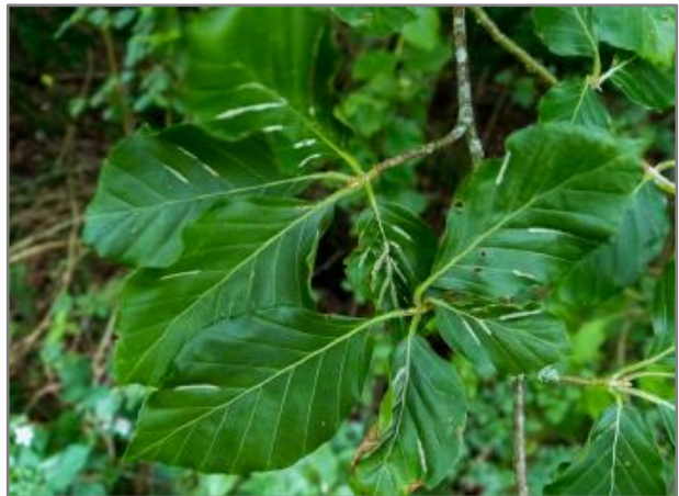
Figure 4: Blotch mines caused by Phyllonorycter moth larvae (left) and symptoms most likely caused by the mite Aceria nervisequa .