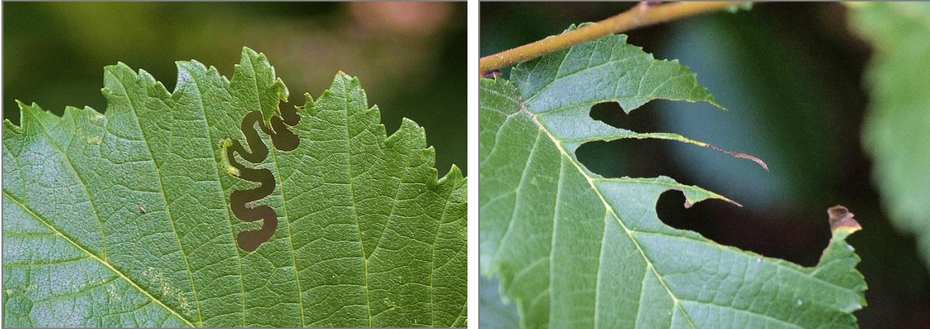
Figure 4: Distinctive zigzag feeding traces made by the younger larvae of Elm zigzag sawfly (left), the more extensive feeding damage of older larvae (right)