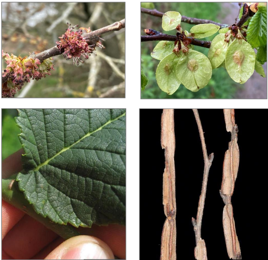
Figure 2: Wych elm flowers in early spring (top left), circular winged Wych elm fruits in late spring (top right), oblique leaf base typical of elms (bottom left), and ‘winged’ branchlets of English elm ( bottom right)

although seed from wych elm is capable of germination and propagation is mainly vegetative via suckers. Overall leaf shape varies from ovate (egg-shaped – widest below the mid-point) through almost orbicular, to obovate (widest above the mid-point) with a bi-serrate margin. Leaf bases are often oblique (asymmetric), sometimes even hiding the leaf stalk (petiole) in wych elm (see fig. 2). Leaf texture varies from rough to smooth. Finally, the twigs of some species can develop corky ‘wings’ like those sometimes found on field maple ( Acer campestre ) and sweet gum ( Liquidambar styraciflua ).