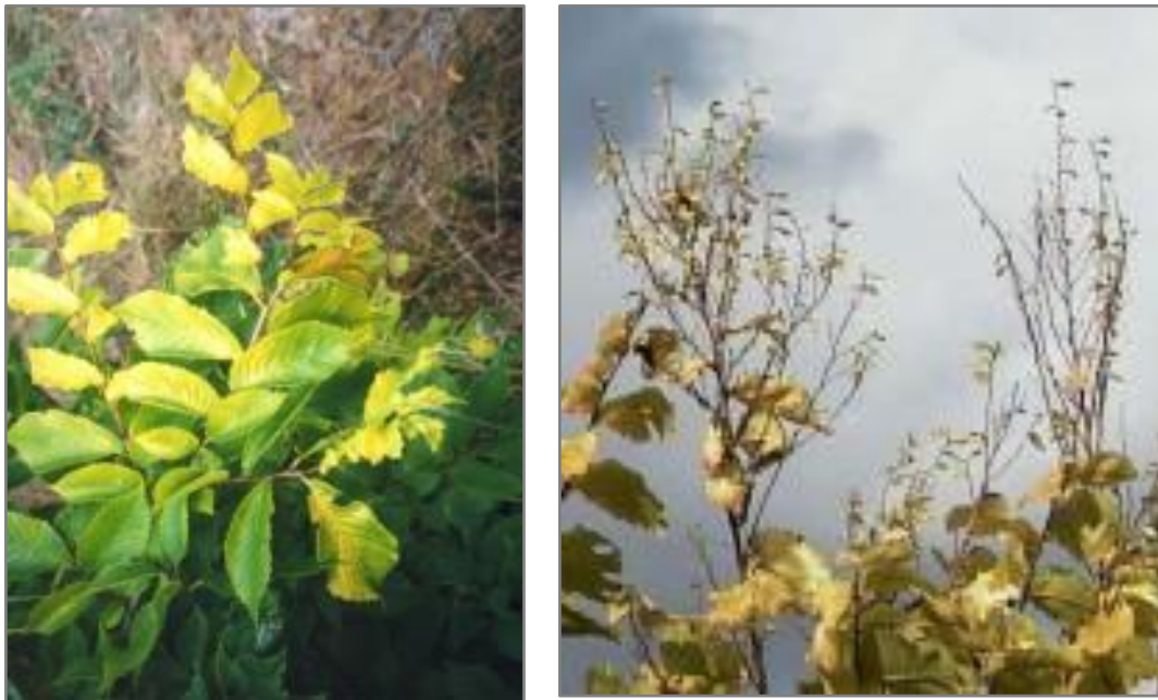
Figure 8: Yellowing of foliage (left) and 'witch's brooms' (right) as a result of infection by Candidatus Phytoplasma ulmi .

Elm yellows is caused by a specialised type of bacterium called Candidatus Phytoplasma ulmi and was found on imported plants in England in 2013 and successfully eradicated. No further cases have been reported. As the name implies a prominent symptom is the yellowing of leaves, accompanied by much reduced leaf size, premature leaf-fall, dense clusters of growth ('witch's brooms') at twig and branch tips, and early opening of leaf buds in spring (fig. 8). More information is available here .