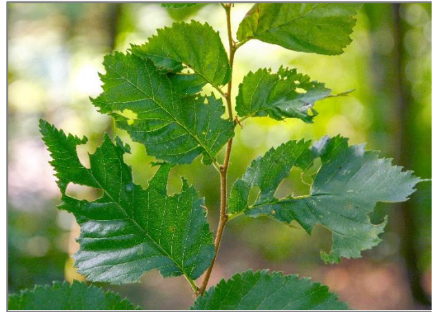
Figure 6: Elm leaf-miner (left), and leaf damage by other invertebrates (right)

Dutch elm disease is still active in the UK and symptoms start to appear in early summer. Clusters of leaves turn yellow and wilt before the turn brown and fall prematurely (fig. 7). Affected shoots die back from the tips, some of them curling to form 'Shepherds crooks'. More information is available here .