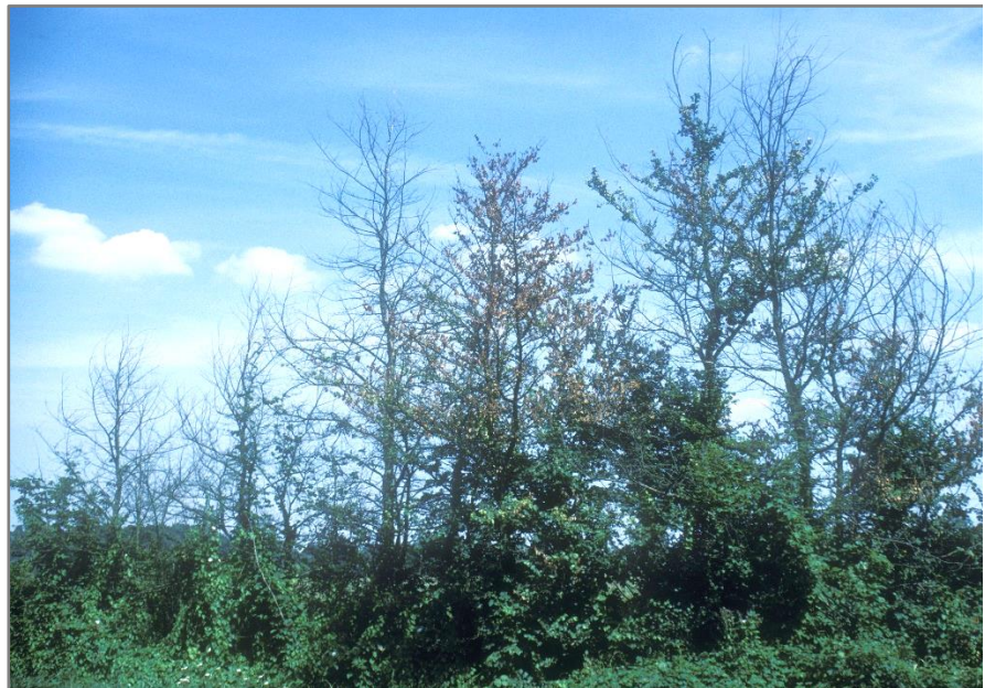
Figure 7: Leaf yellowing, wilting, and browning (left ©Crown copyright, Forestry Commission) and subsequent dieback (right, ©Crown copyright, Forest Research) typical of Dutch elm disease.

Observatree is a citizen science project led by Forest Research, in collaboration with key organisations