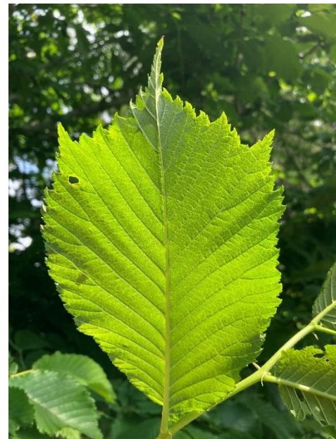
Figure 1: Typical ‘horned’ leaf found on some shoots on Wych elm ( Ulmus glabra )

Elms are deciduous trees with leaves arranged alternately on the shoots. Flowers (figure 2) are relatively inconspicuous, opening in late winter before the leaves for most species and these are followed in late spring by vibrant pale green winged fruits which can be visible from some distance before the leaves emerge and hide them. Although prolific seed producers, most of the seed produced by field elms is not considered viable