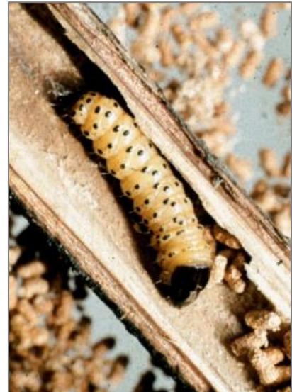
Figure 6: left to right - European goat moth larvae and typical goat moth damage, and leopard moth larvae.