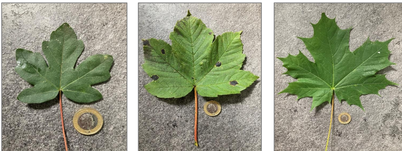
Figure 1: Left to right - leaves of field maple (left), sycamore (middle), and Norway maple (right) - £1 coin for scale.

In the UK only field maple ( A. campestre ) is regarded as native, but there are two other common species, sycamore ( A. pseudoplatanus ) and Norway maple ( A. platanoides ), the best characters to separate them being leaf (fig. 1) and fruit (fig. 2) characters. Sap colour of the leaf stalk (petiole) can be helpful, in Sycamore it is clear whilst in the Norway and field maple it is a white latex. In late spring and early summer flower arrangement and timing can also be useful; Norway maple for example flowers before the leaves emerge, clothing branches in acid-green that are recognisable from quite a distance. In comparison field maple and sycamore flower once the leaves are out.