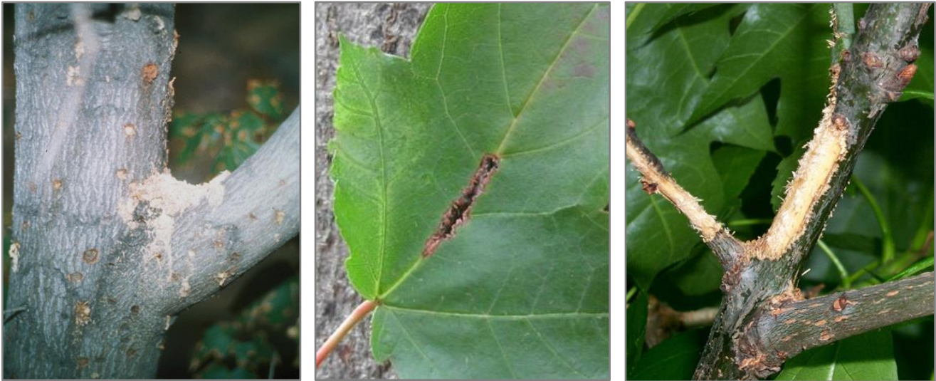
Figure 5: left to right – frass from ALB boring activity gathering in a branch fork, foliar feeding damage by ALB, and ALB feeding damage on young twigs

Larval tunnelling activity produces frass (fig. 5) and this can sometimes be found around the base of infested trees, appearing like fine wood shavings. Longitudinal cracks often form in the bark because of callus tissue growth produced by the tree in response to the tunnelling (fig. 4).