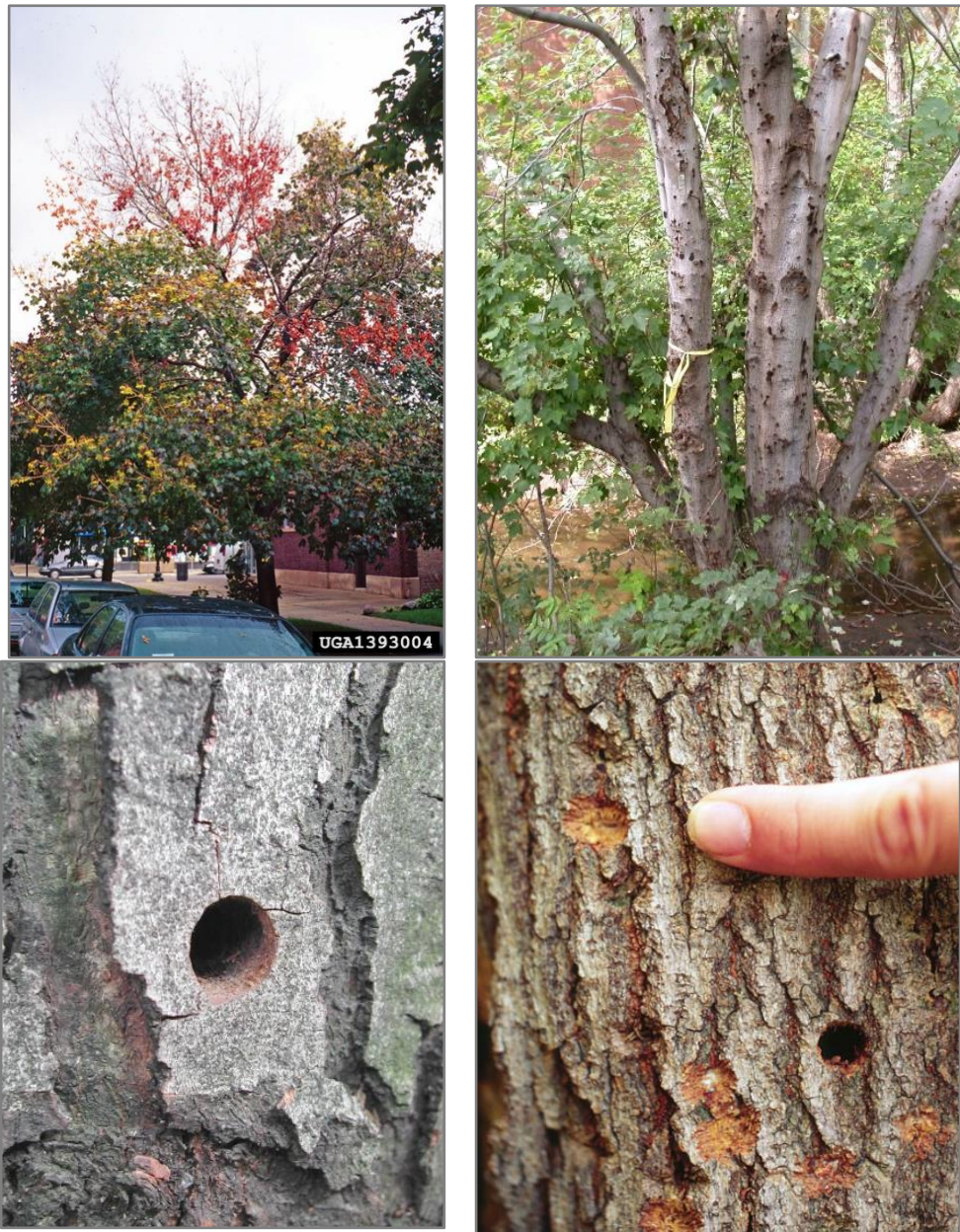
Figure 4: clockwise from top left – maple with signs of crown dieback due to ALB ( Dennis Haugen, USDA Forest Service, Bugwood.org ), maple trunks with a heavy infestation of ALB and multiple exit holes ( Pennsylvania Department of Conservation and Natural Resources – Forestry, Bugwood.com ), egg-laying pits ( Dennis Haugen as above ) and circular exit hole made by ALB ( Pennsylvania Department of Conservation and Natural Resources – Forestry, Bugwood.com ).

Observatree is a citizen science project led by Forest Research, in collaboration with key organisations