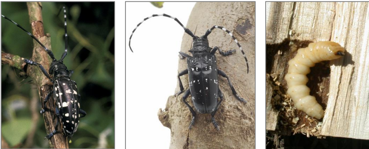
Figure 3: Left to right - Asian Longhorn beetle (© Crown copyright, Forest Research), citrus longhorn beetle (David Crossley FBIPP QEP, © Crown copyright courtesy Fera Science Ltd.) and ALB larva (Thomas B. Denholm, New Jersey Department of Agriculture, Bugwood.org).

grow they chew out tunnels which can be 30cm long and 1 cm in diameter, and these disrupt the movement of water and nutrients in the tree. Once mature the larvae pupate, emerging as adults via 1cm diameter perfectly circular exit holes (fig. 4). In ALB the exit holes are on the branches and upper parts of the stem, in CLB they're on the lower part of the stem and any exposed roots.