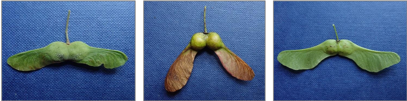
Figure 2: Winged fruits of field maple (left), sycamore (middle), and Norway maple (right)