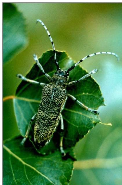
Figure 7: (left) Timberman beetle and (right) Large poplar beetle.

Observatree is a citizen science project led by Forest Research, in collaboration with key organisations