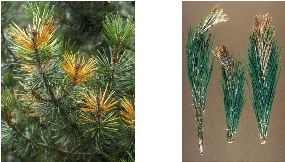
Figure 9: Shoot diseases Ramichloridium pinii (left) and Brunchorstia pinea (right).

Ramichloridium pinii and Brunchorstia pinea affect whole shoots and not just the needles, in both cases the needles towards the tip of affected shoots rather than older needles on previous year's growth and the whole needle becomes straw-coloured (fig. 9).