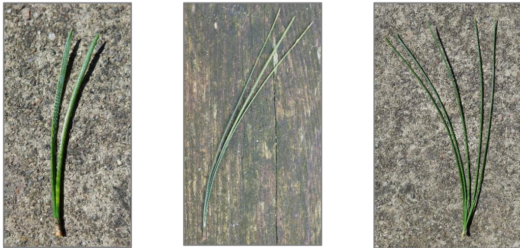
Figure 2: Left to right, fascicles of Scots pine ( P. sylvestris ), Radiata pine ( P. radiata ) and Macedonian pine ( P. peuce ).

In common with other Pinaceae pines bear separate male and female cones on the same tree, the male cones falling soon after releasing pollen. Following pollination the colourful female cones ripen over two years, eventually opening to release seeds with a lightly attached wing which helps to slow their descent and therefore aid dispersal away from the parent tree.