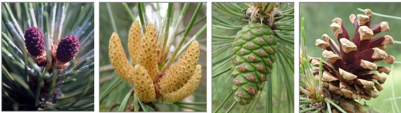
Figure 3: Left to right, Corsican pine ( P. nigra subsp. laricio ) female cones, male cones, unripe maturing female cone, ripe female cone.

In common with other Pinaceae pines bear separate male and female cones on the same tree, the male cones falling soon after releasing pollen. Following pollination the colourful female cones ripen over two years, eventually opening to release seeds with a lightly attached wing which helps to slow their descent and therefore aid dispersal away from the parent tree.