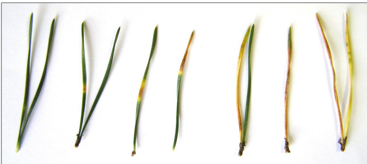
Figure 8: Progression of Lophodermella infection on needles of Scots pine from early (left) to late stage (right).

Lophodermella often only affects one needle of the pair and can initially present banding like that of DNB. Symptom progression is rapid and often just one needle per pair is affected in Scots pine (fig. 8). When fruit bodies appear they are long and thin in comparison to DNB and arranged in neat lines.