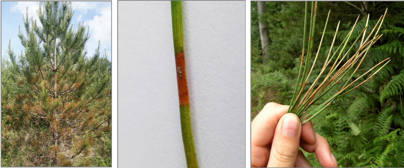
Figure 4: (L-R) Young pine tree with symptomatic needles in the lower crown, a characteristic orange-red band on a Scots pine needle, and infected Corsican pine needles – note the green needle bases.