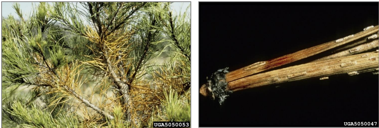
Figure 7: (Left) Cyclaneusma symptoms on pine and (right) dead needles with 'trap door' fruit bodies.

Lophodermella often only affects one needle of the pair and can initially present banding like that of DNB. Symptom progression is rapid and often just one needle per pair is affected in Scots pine (fig. 8). When fruit bodies appear they are long and thin in comparison to DNB and arranged in neat lines.