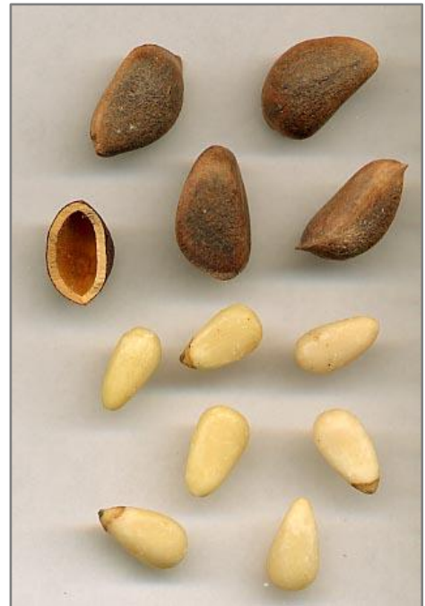
Figure 1: Korean pine seeds

Unlike other Pinaceae the foliage of pines is carried on short shoots which appear as bundles of 2, 3 or 5 needles (fig. 2). As usual trees don't read the rules and other numbers can be present but these numbers are dominant. The base of each 'bundle' is wrapped in a papery sheath, the combined structure is known as a fascicle and falls as a single unit. Needles generally remain on the tree for between three and five years though factors such as drought or pests/diseases can reduce this.