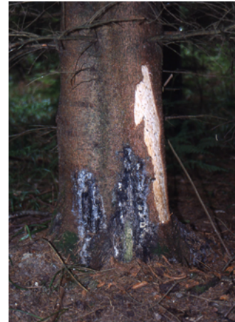
Squirrel damage can happen in the canopy of a tree or at the base as on this Norway spruce.