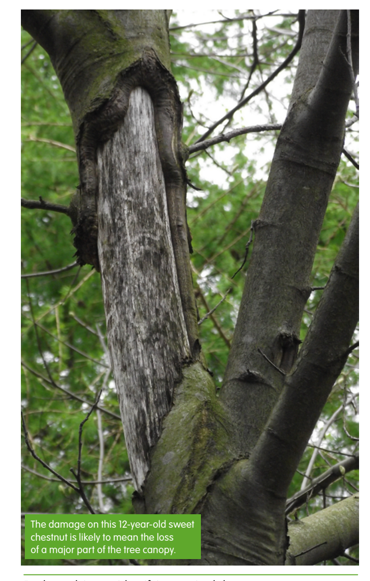
Further advice on identifying squirrel damage, as well as managing squirrel populations, can be found online at forestry.gov.uk/squirrel-damage