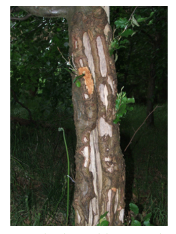
Accumulated squirrel damage can be seen on the bark of this beech tree.