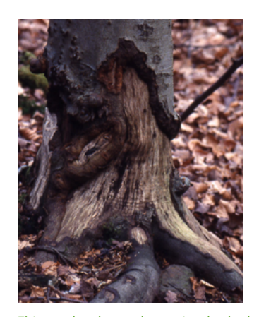
This tree has been almost ring-barked and is at risk of being killed.