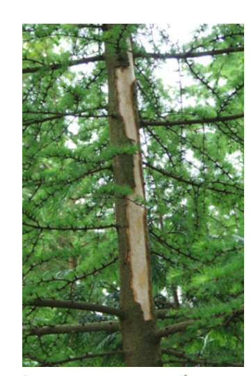
Damage can occur on conifers as well as broadleaved trees.

Trees under stress due to squirrel damage are more vulnerable to other pests and diseases.