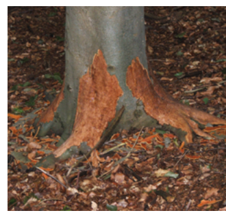
Squirrels do not eat the bark and the chips are visible on the ground.