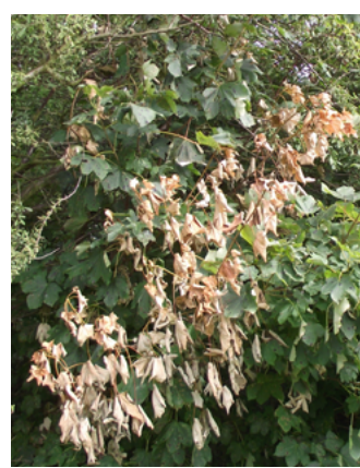
Squirrel damage on the canopy of this Sycamore is a sign of damage that can be spotted from a distance.