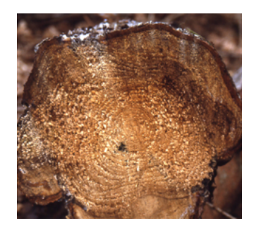
Squirrel damage can act as a potential inroute for disease.